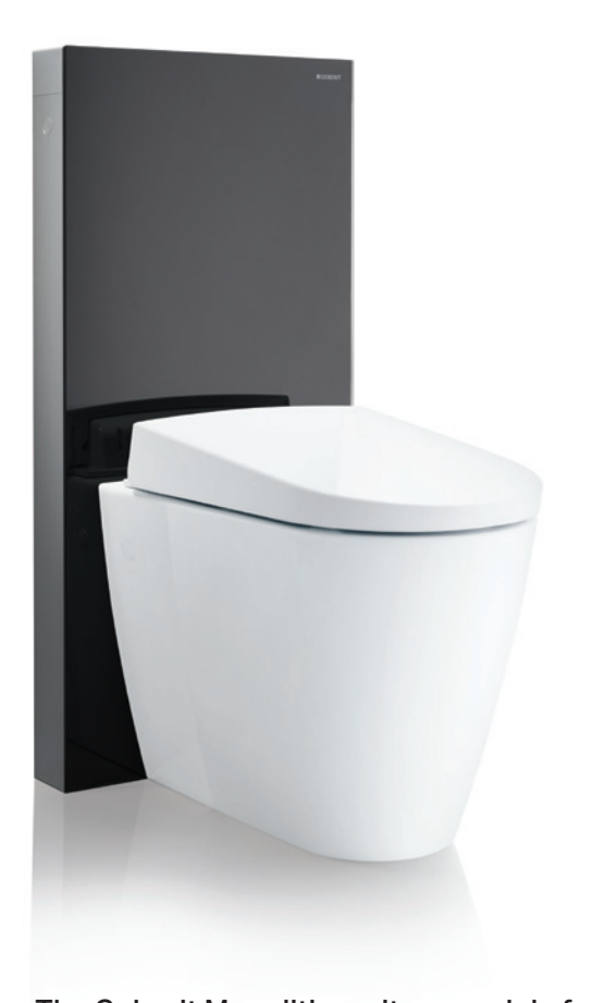
The Geberit Monolith sanitary module for the WC is an attractive alternative to exposed or concealed cisterns. All the necessary installation technology including water inlets and outlets and the cistern itself are hidden beneath an elegant glass housing in white, black or umber. Matching Geberit Monolith sanitary modules for the washbasin allow a coherent bathroom design to be created all from a single source.