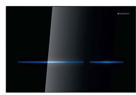
↑ The innovative, touch-free Geberit Sigma80 flush plate can be operated easily and hygienically. A simple push of the hand is enough to activate the dual flush.