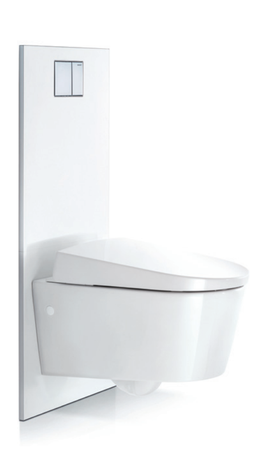
The Geberit AquaClean Design Panel allows the connections for a shower toilet to be laid cleanly and elegantly without effecting the existing tilework. The slimline panel is fixed to the flat tile surface and can be removed at any time without leaving any traces.