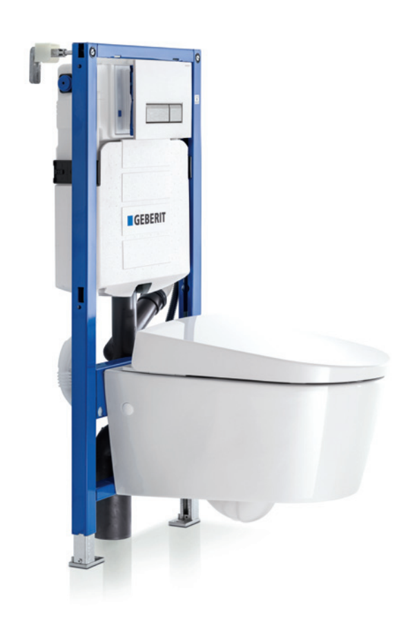
The new WC elements from Geberit are tailored to match the dimensions of the Geberit AquaClean products, ensuring that all connections fit perfectly. In combination with Geberit Duo Fresh, odours are extracted inside the ceramic pan itself.

Geberit shower toilets offer a great deal of scope for bathroom layout, thanks not only to the design of the products themselves but also to their connection technology. Geberit AquaClean complete solutions fit all Geberit installation and flushing systems. In renovated bathrooms, Geberit AquaClean can also be combined with the Geberit Monolith or with the Geberit AquaClean Design Panel.