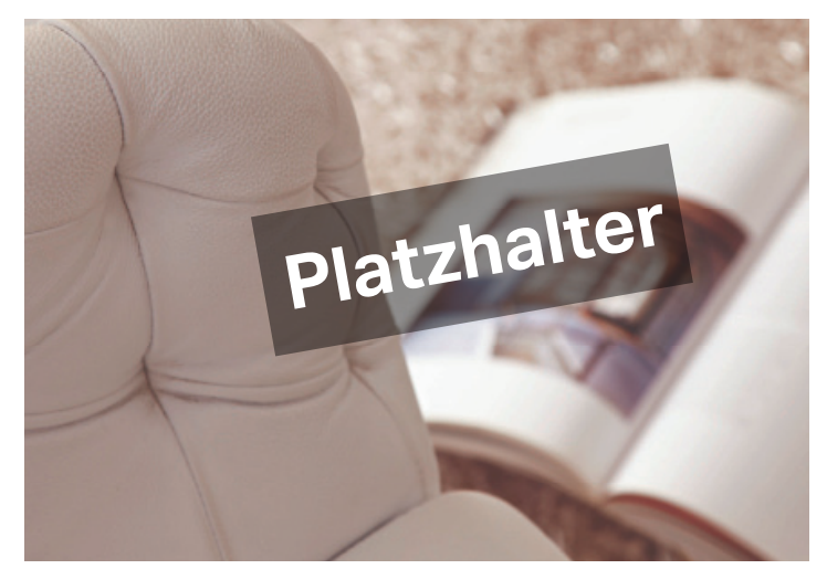
↑ Caption Title; Lorem ipsum