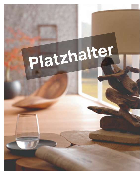
↑ Caption Title; Lorem ipsum