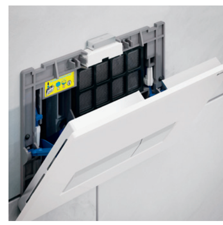
↑ More freshness with every flush thanks to Geberit DuoFresh: an active carbon filter, integrated elegantly into the flush plate, plus a practical insert for in-cistern blocks.